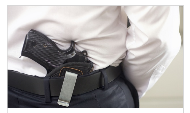
A Secured Entrance Is The First Defense Against An Active Shooter