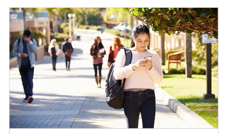
What Are The Challenges Of Protecting Large Campuses?